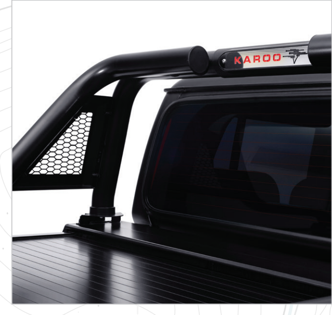
ROLLER BARS WITH SECURE ROLLER SHUTTER TONNEAU COVER