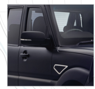
ORVMS WITH SIDE TURN INDICATORS